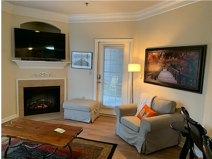
Rosie's Place Living Room