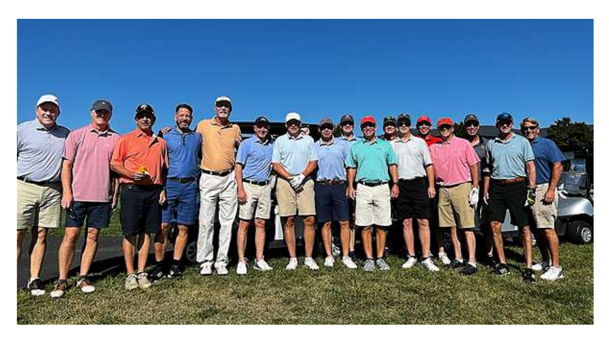
3rd Annual Golf Tournament Registration is officially open!