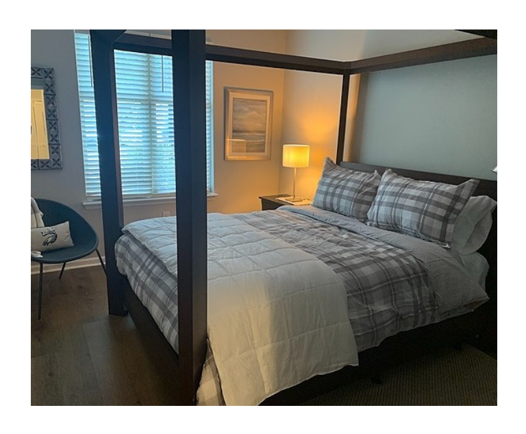
Tommy's Place Yellow Door's 7th Apartment!

If you would like to visit a Yellow Door Apartment to meet families and see first-hand what your support does, or volunteer your time and talents: