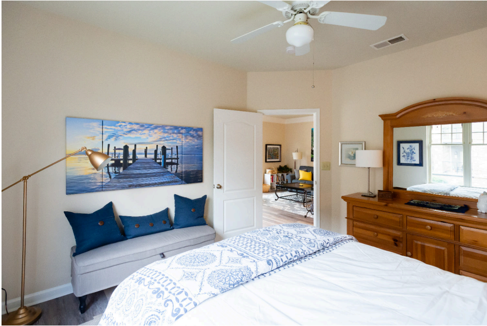
VOGA Apartment Bedroom

Come Visit Us to See Your Impact First-Hand